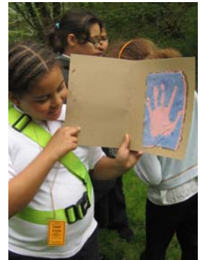
A student shows off the paper she made at RittenhouseTown

Our 2008 Sponsor-A-School program was supported by both the Skilling and Ludwick Foundations.