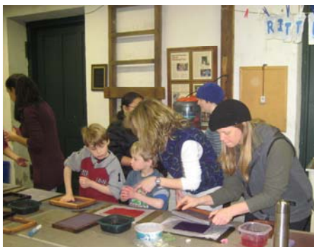
On February 7, over thirty papermakers joined us to make valentines in the barn