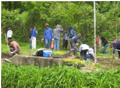
Volunteers remove invasives near the barn