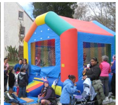
Over 100 children joined us for our Annual Egg Hunt on April 4. This year we added a spring Fair that included a moon bounce, sand art, face painting and papermaking