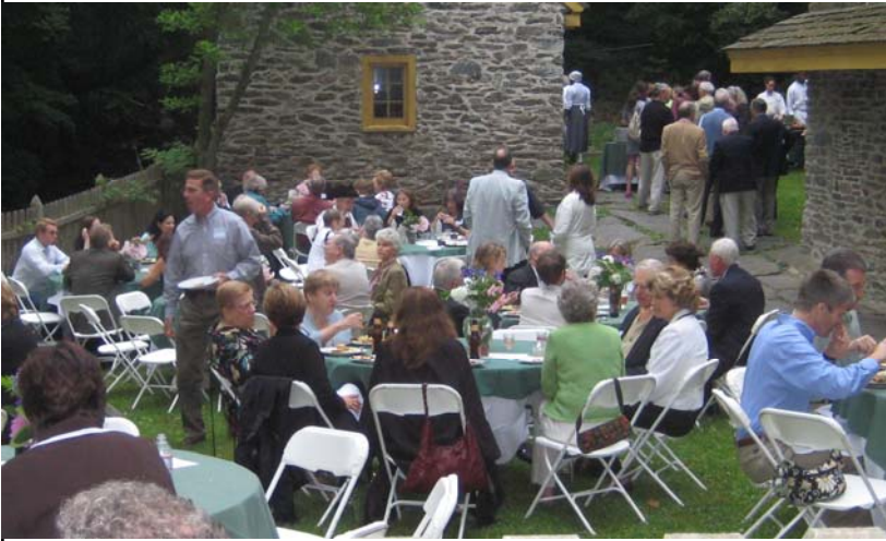
Guests enjoy their food while sitting near the original 1707 Rittenhouse Homestead.